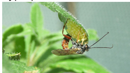
Hyposoter horticola wasp laying eggs in Melitaea cinxia eggs.

Evil parasites are the stuff of horror movies, bursting out of unsuspecting victims in the most ghoulish fashion possible. However, it seems that even parasites are not immune to parasites of their own. Anne Duploux, Saskya van Nouhuys and Minna Kohonen from the University of Helsinki, Finland, describe how Hyposoter horticola parasitic wasps, which exclusively target Granville fritillary butterfly caterpillars – on the Åland Islands off Finland – are susceptible in turn to Mesochorus cf. stigmaticus hyperparasitic wasps, which hijack H. horticola larvae as incubators for their own offspring. However, Duploux had also noticed previously that H. horticola populations had lower levels of M. cf. stigmaticus infection where H. horticola had high rates of infection by the symbiotic Wolbachia bacteria (doi: 10.1371/journal.pone.0134843). Explaining that Wolbachia infections are often beneficial to their hosts in order to maintain their welcome, Duploux wondered whether the bacteria also boosted the resistance of H. horticola to M. stigmaticus hyperparasitic lodgers – consequently reducing M. cf. stigmaticus infection rates when Wolbachia infection rates are high. However, there was an alternative explanation for low levels of M. cf. stigmaticus infection: if Wolbachia reduced the resistance of H. horticola to M. cf. stigmaticus , this would allow M. stigmaticus to kill off Wolbachia -infected H. horticola to keep their numbers down when M. cf. stigmaticus infection rates were high.