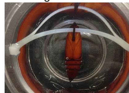
Submerged Manduca sexta pupa.

Dragonfly larvae are perfectly equipped for a life of total immersion in their pond homes prior to emergence for their final metamorphosis. However, other species may be less well prepared for soggy starts in life. Art Woods from the University of Montana, USA, explains that although the larvae and pupae of other insects spend some portion of their lives buried in dry soil, their conditions can change rapidly when the weather turns. Whether it’s the onset of the monsoon or a rapid thaw, dry soil in river beds and desiccated flood plains can flood quickly, submerging larvae as the soil saturates. ‘Anoxia can be highly stressful, even in highly anoxia-tolerant individuals’, says Woods, who was intrigued by how well Manduca sexta moth pupae survive drowning.