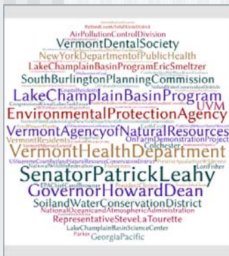
Figure 2.1 Prominence of individuals and organizations in a sample of newspaper articles on Lake Champlain focusing events from 1990-1999.