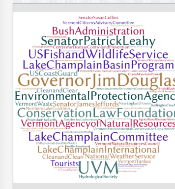
Figure 2.2 Prominence of individuals and organizations in a sample of newspaper articles covering Lake Champlain focusing events from 2000-2012.